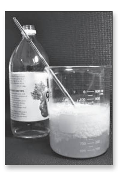
When vinegar is added to milk, a bioplastic forms.